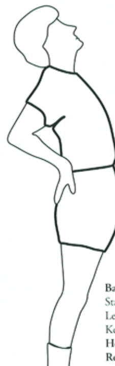
Backbends Stand with hands on hips. Lean backward. Keep knees straight. Hold for 2-3 counts. Repeat 5 times