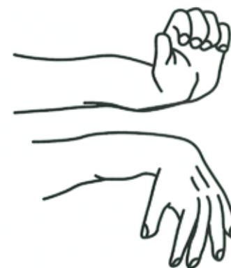
Wrist/Forearm Stretch Hold both arms out higher than your heart with elbows straight and palms down. Move your wrists up and down together 5 times.