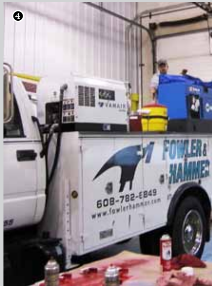
Pics from top: 1. 2. & 3. Progress at the DOIM jobsite. 4. Cody Heilman packing away the generator on the mechanics truck. 5. Tim Kappauf fixing a chop saw in the shop. 6. Kasey giving the low down on the new truck lifts installed by Michaels Hoist.